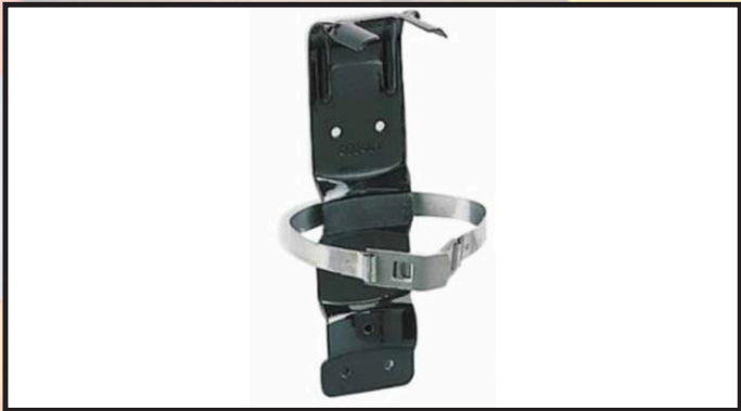
Fire Extinguisher Brackets, Metal, Black, 4-5 lb