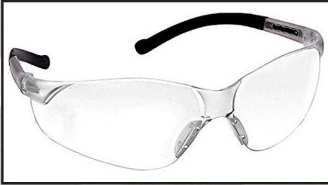
CREWS BK110 Bearkat Safety Glasses Clear Lens with Logo on Right Lens