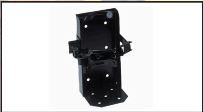
Vehicle Brackets, Steel, Running Board Bracket Black For 5 lb Units