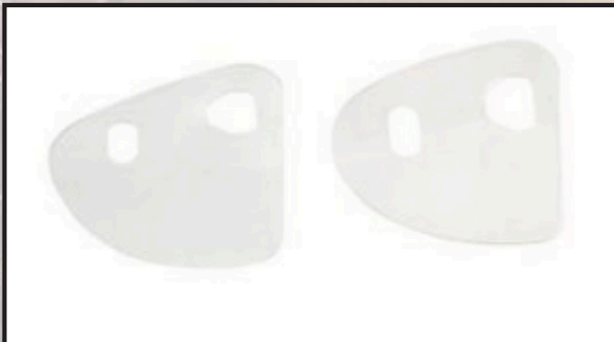
Slip-On Eye Shields