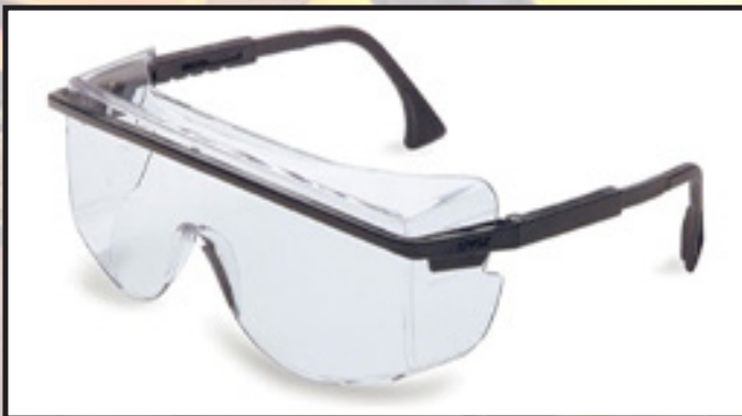
UVEX Astro OTG Safety Glasses