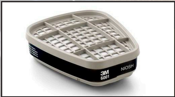
3M Organic Vapor Cartridge