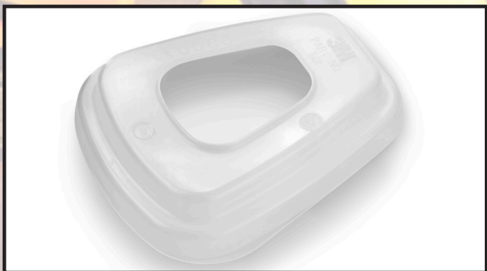
3M Filter Retainer 501