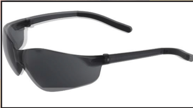
CREWS BK112 Bearkat Safety Glasses Grey Lens with Logo on Right Lens