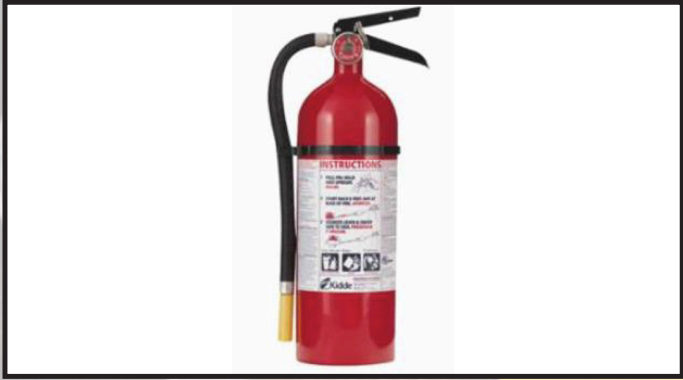
ProLine Multi-Purpose Dry Chemical Fire Extinguisher ABC Type, 20 LB Cap. Wt. With Wall Bracket