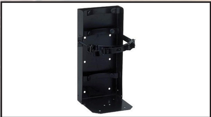
Vehicle Brackets, Metal, Running Board Bracket for 10 lb Units