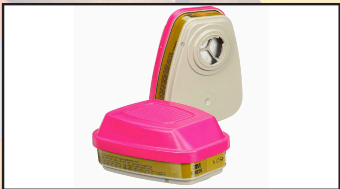
3M 60926 Cartridge/Filter Multi GAS/VPR/P100