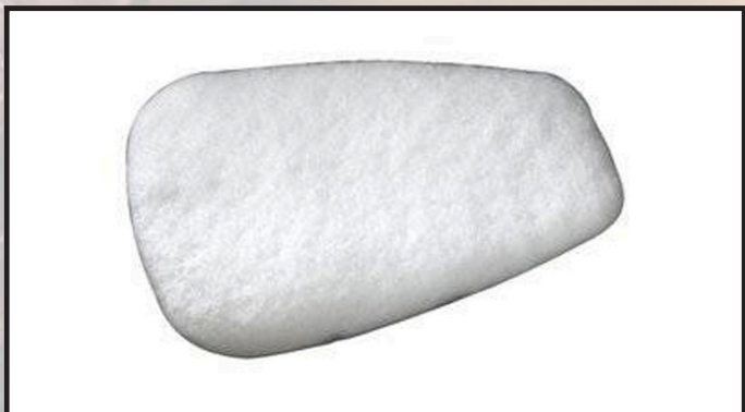
Filter, N95, Bayonet, PK10